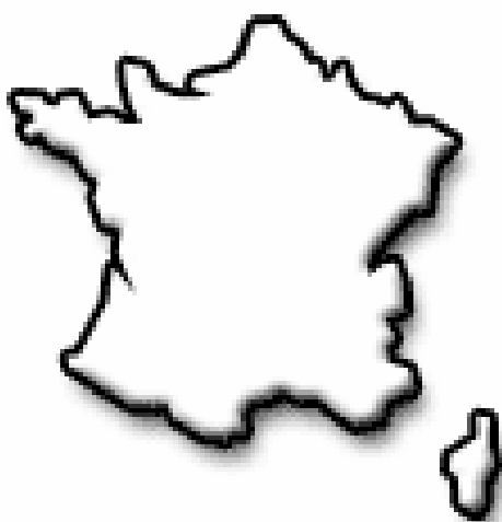
Map of France