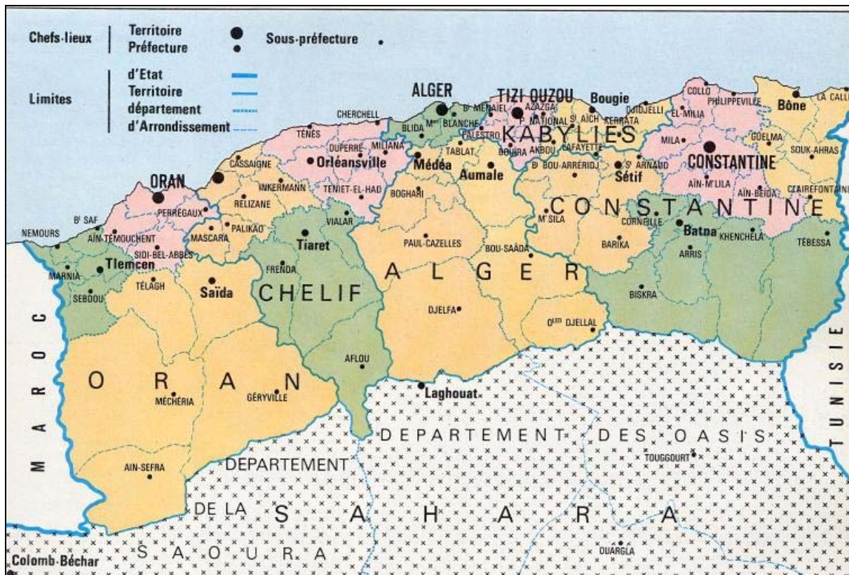
Map of the old French departments in Algeria (retrievable on several web sites).

1962- After independence of Algeria in 1962, the 15 departments (9A-9R, 8A, 8B) have still existed until 1978. Independant Algeria will use during several years the French mapping of its territory. The numbers of the old French departments will be use until 1964.